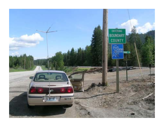
AB7RW on CL Boundary ID 2006