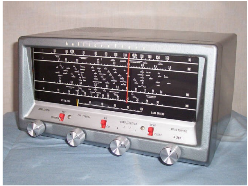
Hallicrafters S-38 E

Lafayette offered the low end HE-30. It was made by Kenwood and was a decent radio with calibrated ham bands. It had a few more tubes in it.