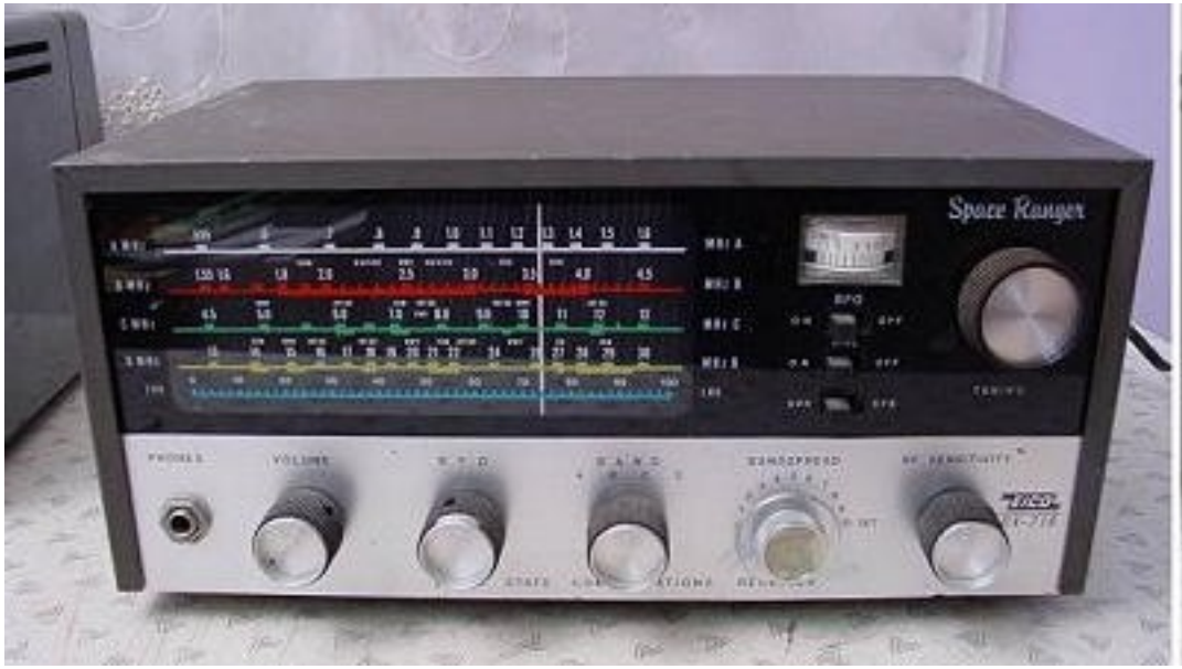
EICO DX 718 Space Ranger

There were quite a few similar radios such as the National NC-60 which first came out in 1959 – It was an AC/DC single conversion superhet.