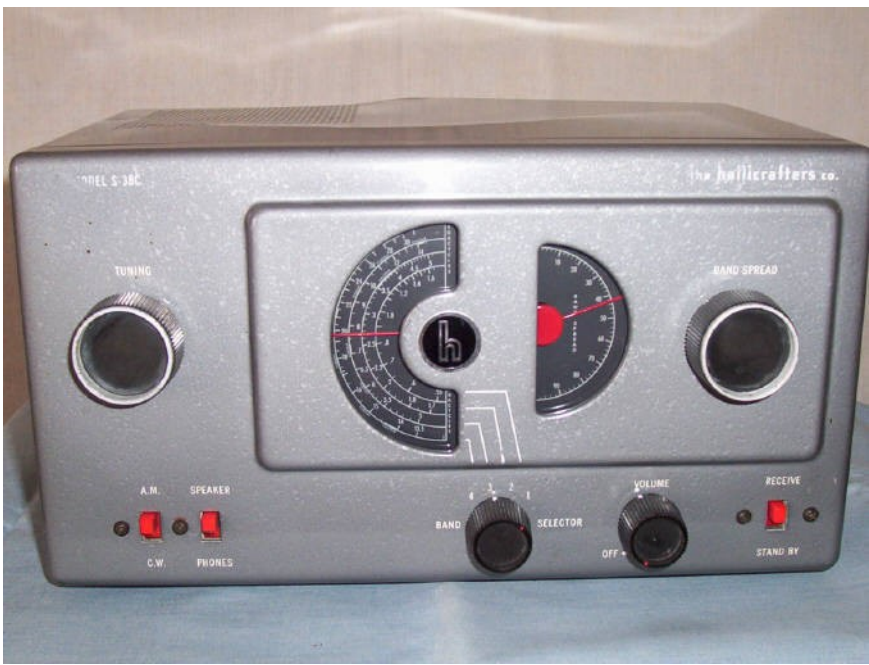
Hallicrafters S-38C Receiver

doesn't drift, stays within 25 Hz of where it started at, and has great selectivity – in a small package along with a equally nice transmitter!