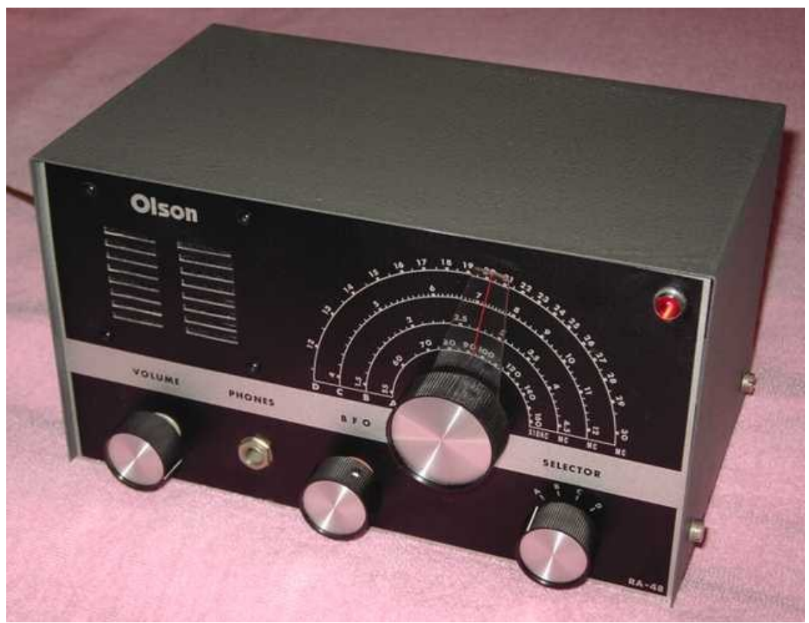
Olsen RA 48 (no bandspread)

where old radios are fired up to make contacts. I'd bet most hams would have a hard time finding a friend with a 'tube tester' to help them diagnose problems in their tube type equipment now a days! Other than the 'tube' in their computer monitors (and that too is going away) or the tube in their older TV set (those CRTs), or in an oscilloscope, or the output tubes in their high power linear amplifiers, most hams don't own anything with 'tubes' in them unless they have a relic from way back (or are a collector of vintage gear such as Collins). That shouldn't be surprising since ham gear went solid state in the 70s, which is over 35 years ago.