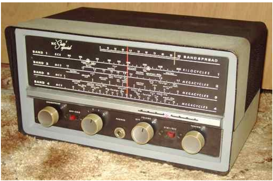
National NC-60 Receiver

There were quite a few similar radios such as the National NC-60 which first came out in 1959 – It was an AC/DC single conversion superhet.