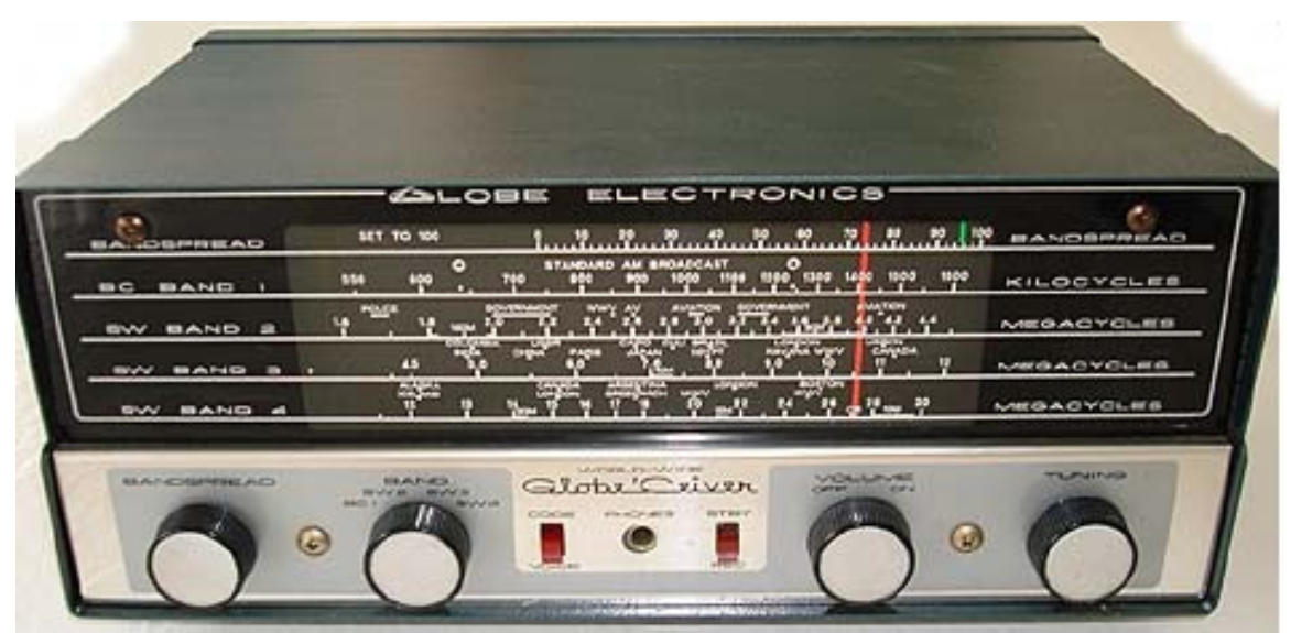
Globe 65-320 Also sold by WRL and RME

Back in the 50s and 60s, nearly every country had major high power short wave stations that operated many hours a day – with hours and hours in English. You could listen to 50 or 60 different countries, hear their news, some cultural programs and music, and collect "SWL Cards" by making reception reports. The US and Russians had a cold war going, and there was lots of propaganda broadcast from both sides. Now, that the television and internet have taken over as the chief news sources, most countries have discontinued or severely cut back on broadcasting services. There's not as much to listen to, and broadcasting is more less interesting. The US has decommissioned most of the US sites it used to broadcast (OH, SC, CA, etc).