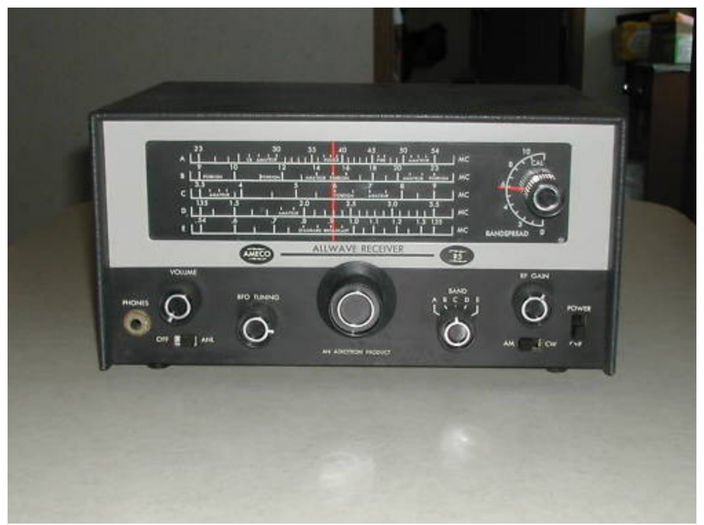
Ameco R-5 receiver

This was one of many 'introductory' SWL type receivers that were used by starting hams to try and get on the novice bands. In most cases, they had fairly marginal performance, fair cw reception – but usually no filtering or narrowing of the bandwidth for cw, no calibration/bandspread of the ham bands, etc.