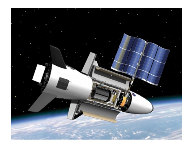
"Flying Twinkie" - X-37B

The smart money is betting that the flight will put to the test systems that enable satellites to protect themselves from enemy attack. The most important trick in such self-protection is determining whether you are under attack at all. A clever enemy will want the attack to seem to be a mere accident. That way he'd leave no return address.