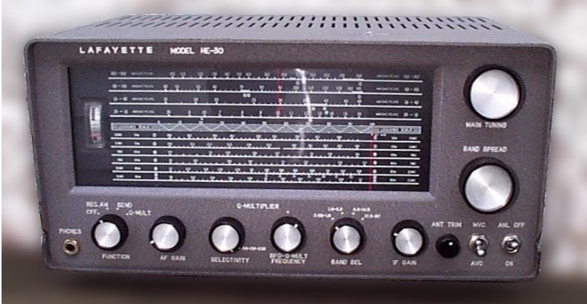
Lafayette HE -30

Lafayette offered the low end HE-30. It was made by Kenwood and was a decent radio with calibrated ham bands. It had a few more tubes in it.