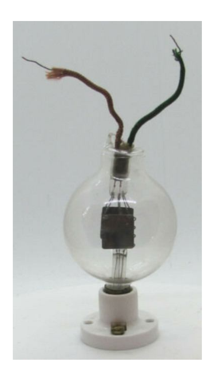
Detail of the grid.