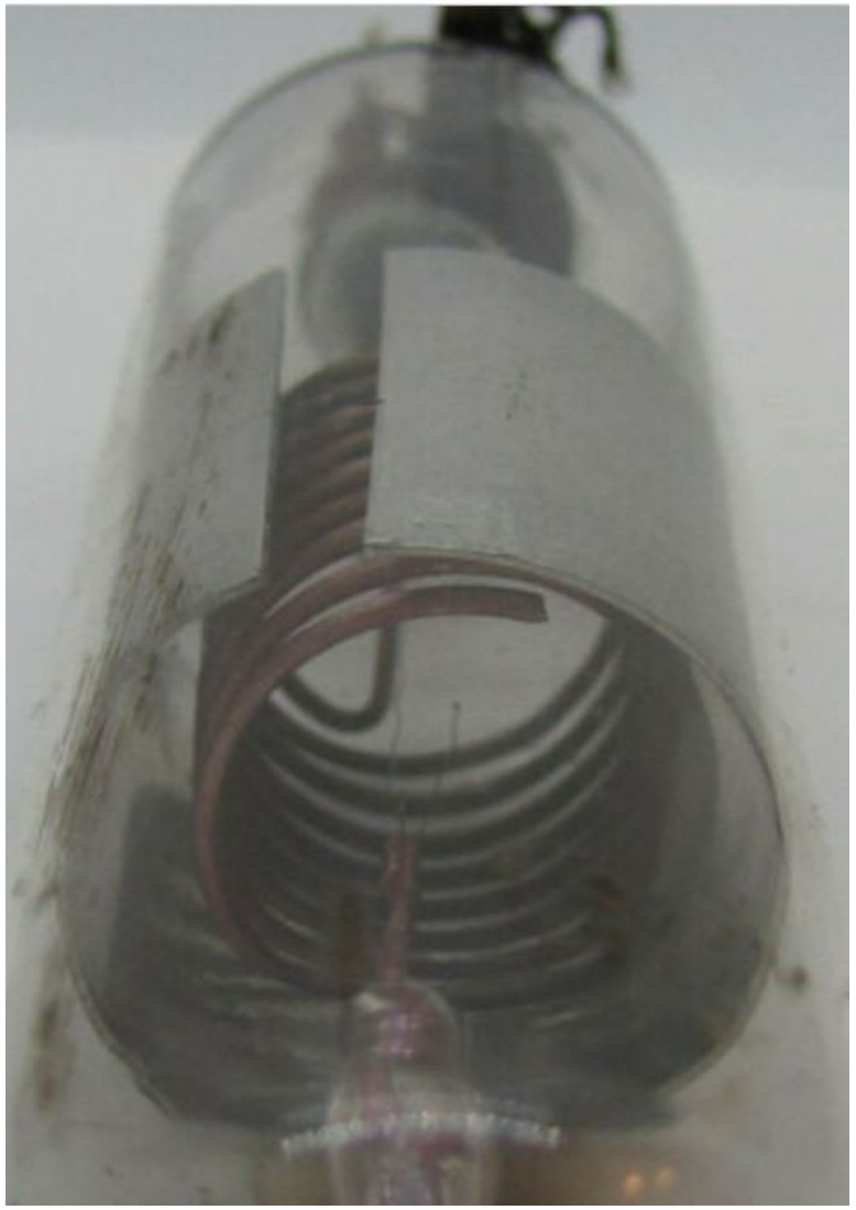
Inner Detail of Grid

These tubes barely worked at audio frequencies and were not very good at 30-600 KHz where nearly all the radio activity took place. Most of the communications was 'marine' – ship to ship and ship to shore at the time – oh, and 'spark gap' transmitters. Ham radio enthusiasts had been banned in 1912 to frequencies above 1.5 MHz (200 meters and down). These tubes didn't work up that high in frequency.