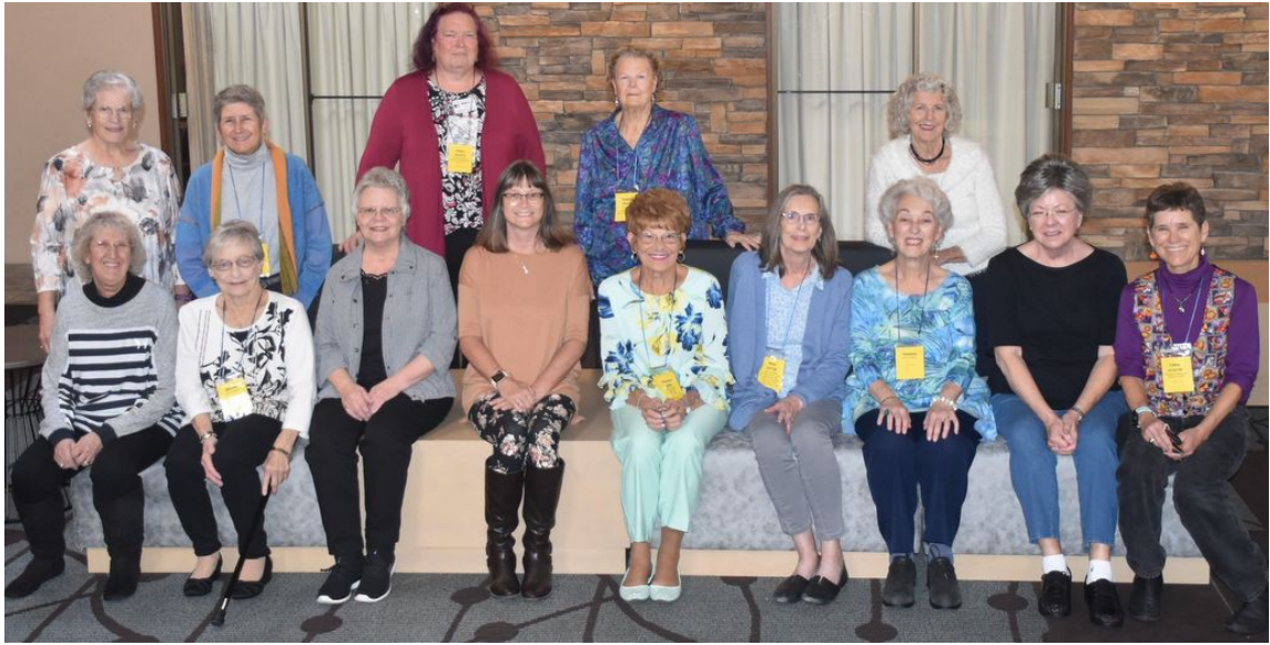
YL s at Bozeman 2022