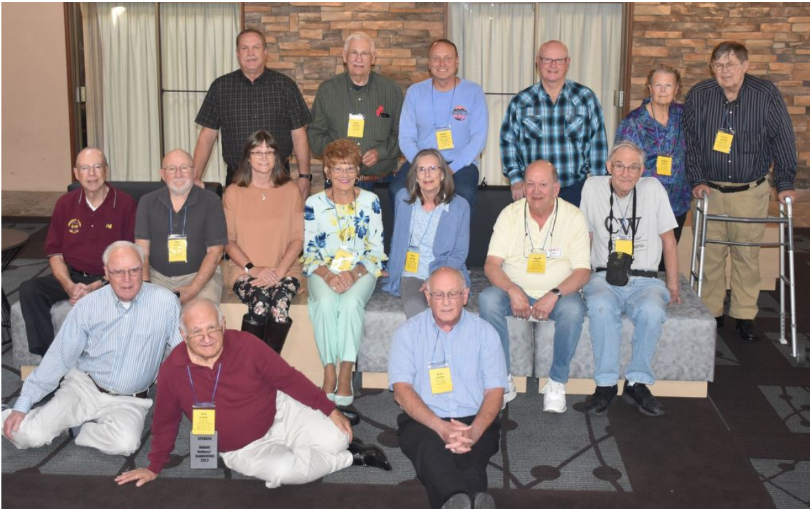
CW Ops at Bozeman 2022