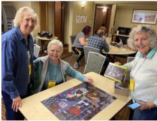
Crossword Puzzle Folks