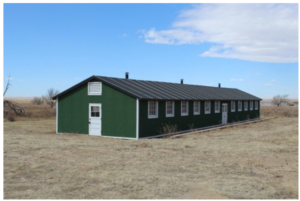
Barracks – Reconstructed

I traveled to the site on March 29, 2022, and activated K-9683. A total of 88 contacts were made - 67 on SSB and 21 on CW.